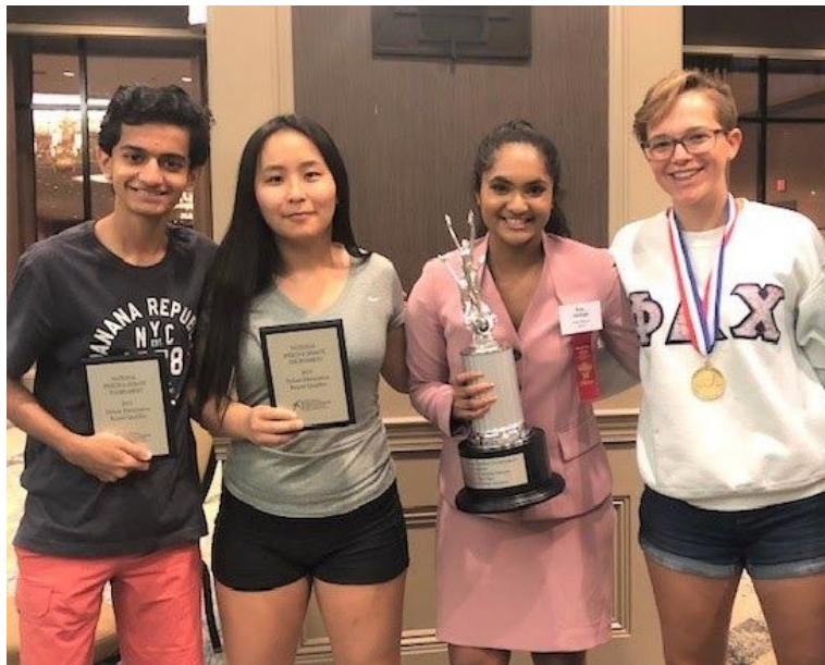
NSDA Nationals, Dallas, June 2019